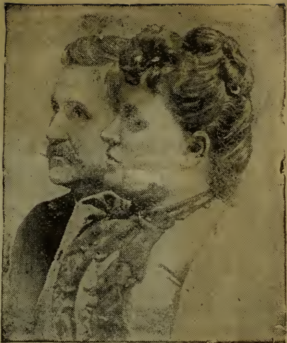
ARE THEY WELL MATED?